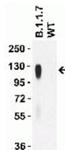
Figure 2. WB Validation of P681H Mutant Specific Spike Antibodies with SARS-CoV-2 Alpha Variant Spike S1 Protein. Anti-2019-nCoV Spike P681H mutant specific antibody (7A4D12) can specifically detect UK variant spike S1 protein, but not WT spike S1 protein (50ng protein per lane).